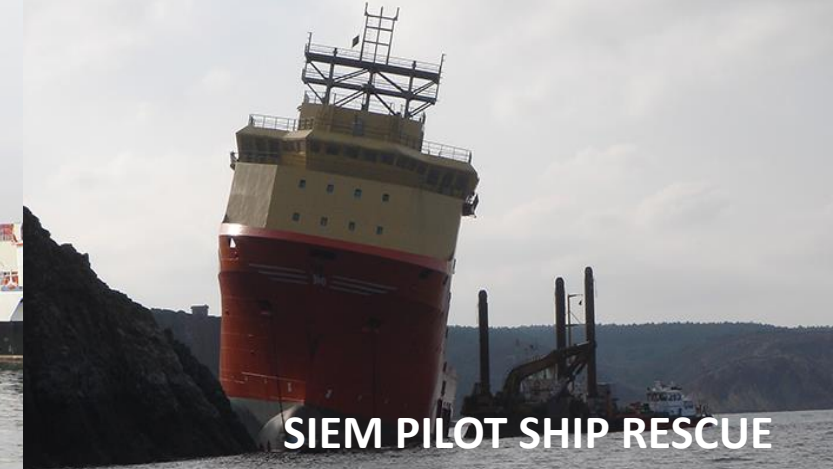
SIEM PILOT SHIP RESCUE