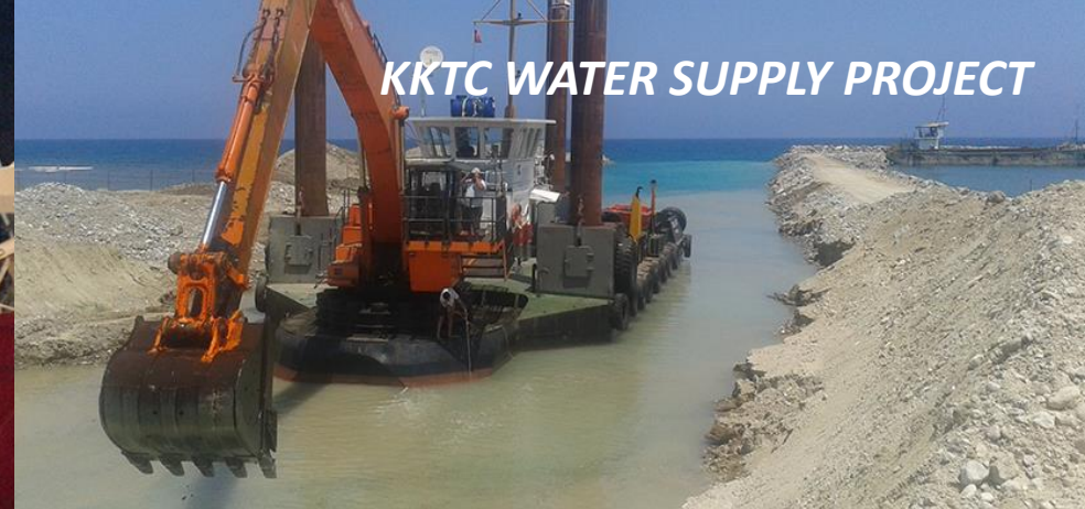
KKTC WATER SUPPLY PROJECT