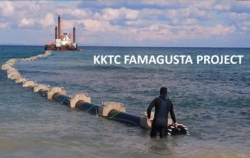
KKTC FAMAGUSTA PROJECT