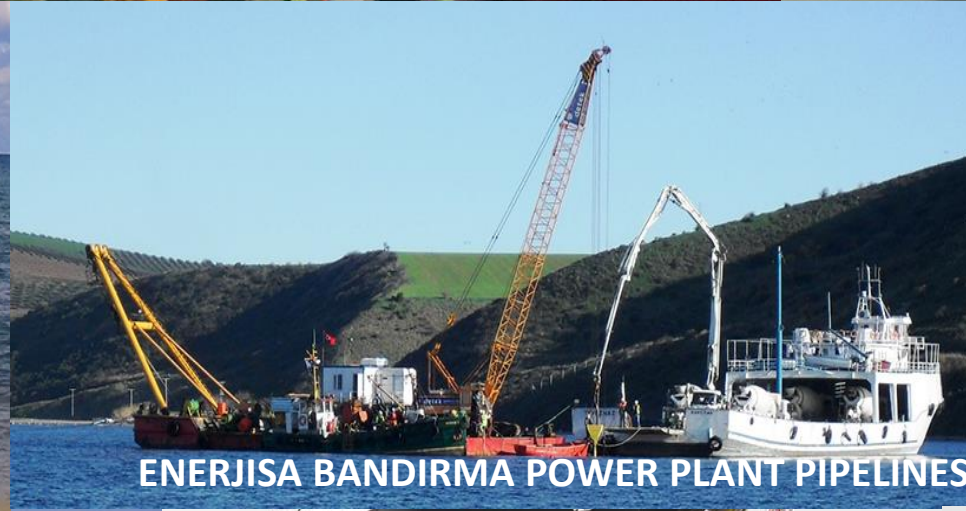
ENERJISA BANDIRMA POWER PLANT PIPELINES