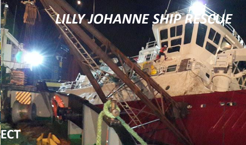
LILLY JOHANNE SHIP RESCUE