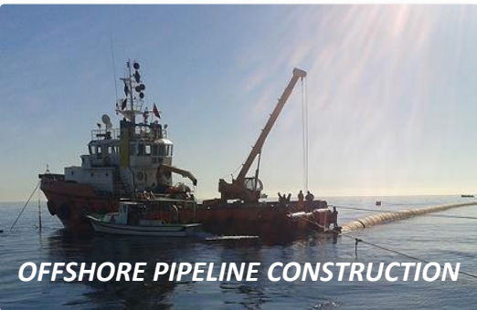
OFFSHORE PIPELINE CONSTRUCTION