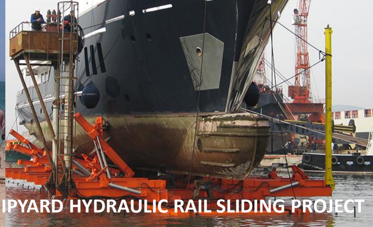
RMK SHIPYARD HYDRAULIC RAIL SLIDING PROJECT