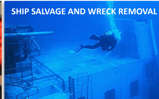
SHIP SALVAGE AND WRECK REMOVAL