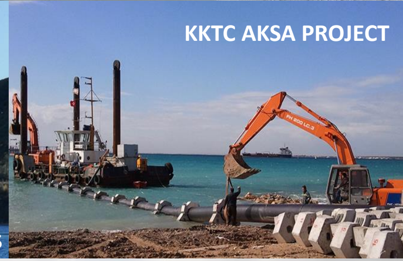
KKTC AKSA PROJECT