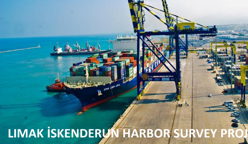
LIMAK İSKENDERUN HARBOR SURVEY PROJECT