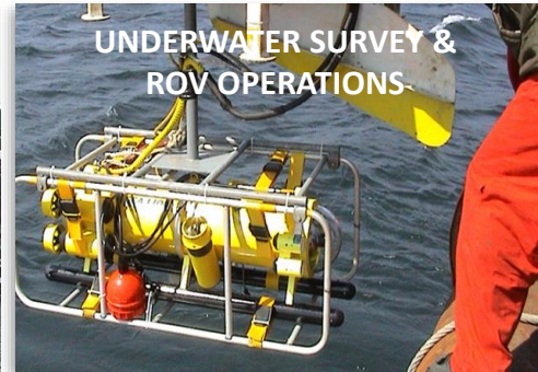
UNDERWATER SURVEY & ROV OPERATIONS